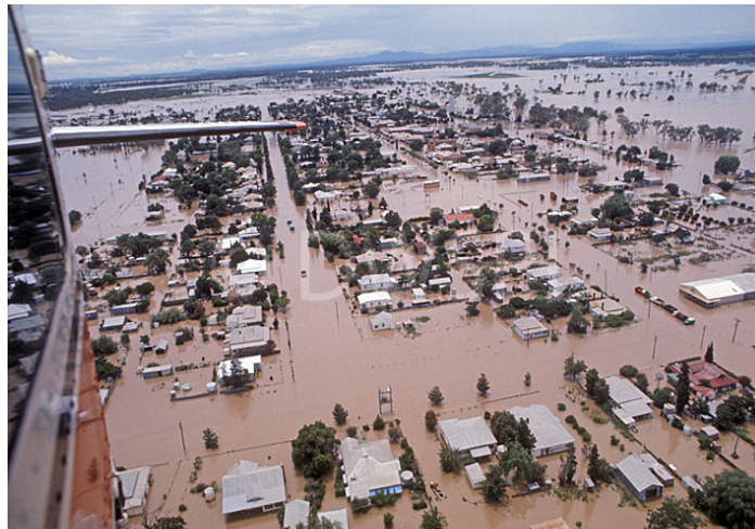
Flooding in NSW

CSIRO, the Bureau of Meteorology and the Department of the Environment and Energy have provided a comprehensive portal for climate projection science, data and information called Climate Change in Australia . This website includes regional climate projections, a publication library, guidance material and a range of interactive tools.